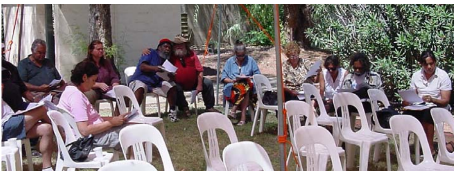
CASG&FAC Members at the AGM in November 2004